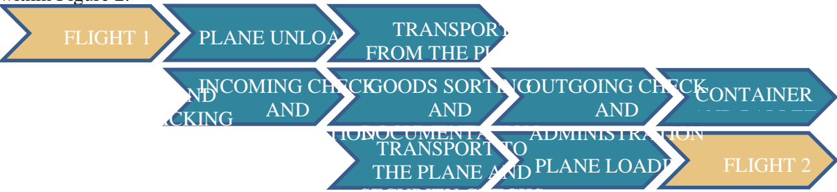
Figure 2. Scheme of the transit shipment process.

In case of a transfer/transit shipment, the process between flights would correspond to the one shown within Figure 2.